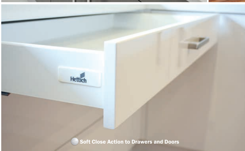
Soft Close Action to Drawers and Doors