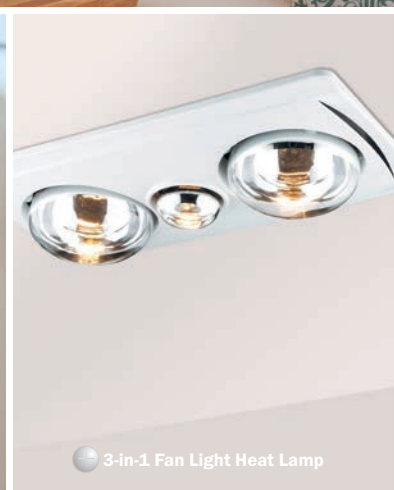
3-in-1 Fan Light Heat Lamp