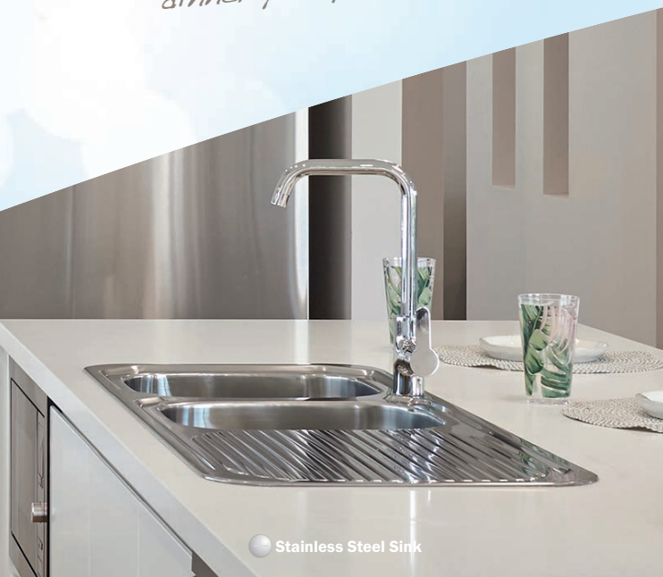
Stainless Steel Sink

Just can't wait for my next dinner party