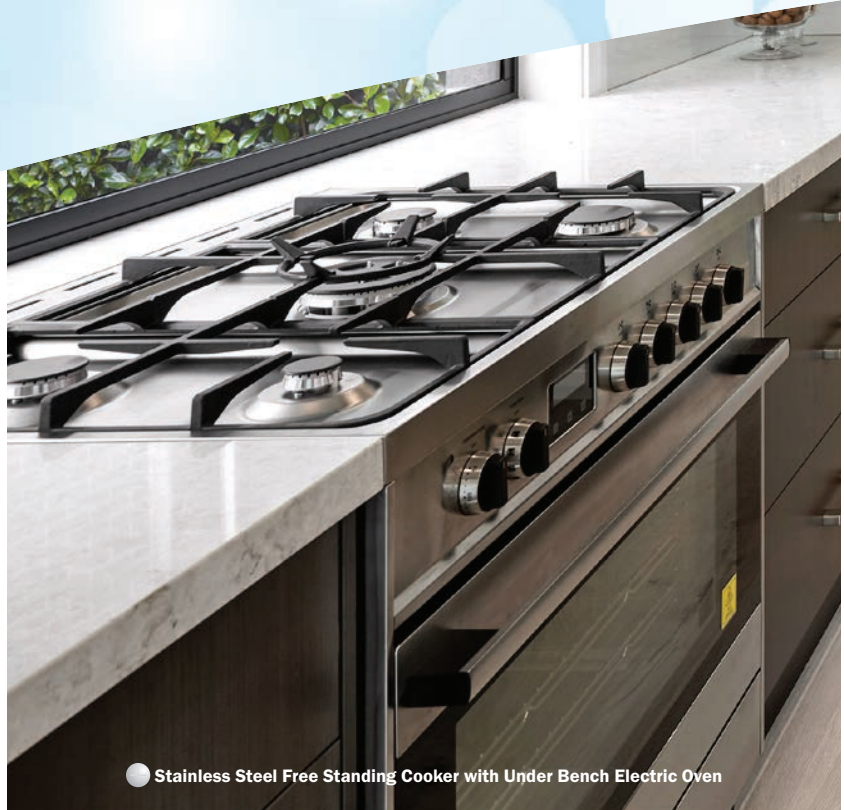
Stainless Steel Free Standing Cooker with Under Bench Electric Oven