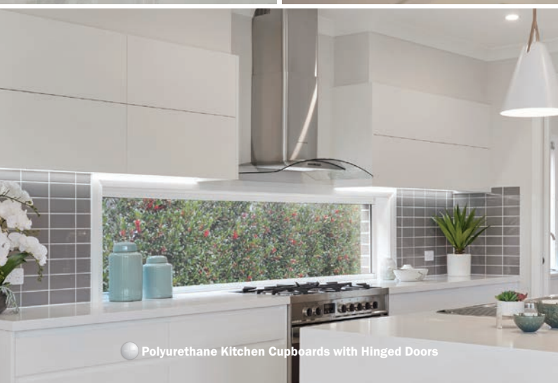
Polyurethane Kitchen Cupboards with Hinged Doors