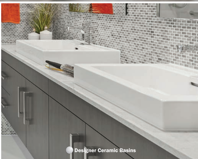
Designer Ceramic Basins