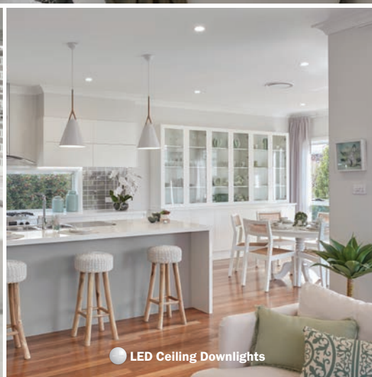
LED Ceiling Downlights