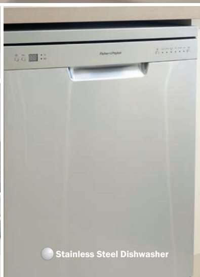
Stainless Steel Dishwasher