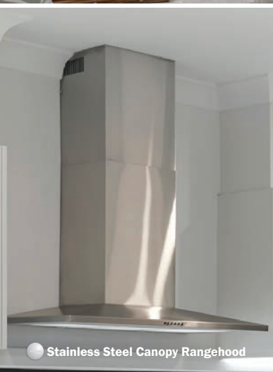
Stainless Steel Canopy Rangehood